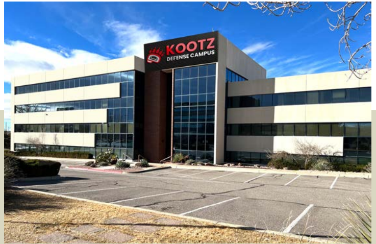
A mock-up for the new signage and branding for the re-named Kootz Defense Campus.

The cost of this effort was offset by a government rebate of approximately $14,000 and will further provide substantial savings against the buildings overall power usage.