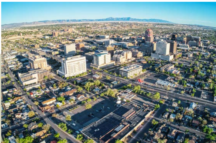
Albuquerque, New Mexico

In order to improve Newport IV for its current and future tenants, as well as better prepare it to serve as Kootznoowoo's 8(a) headquarters, the corporation executed several improvement efforts. This included installing four E/V charging stations and transitioning to LED lighting to become greener and lower the building's carbon footprint. All 950 light fixtures were upgraded.